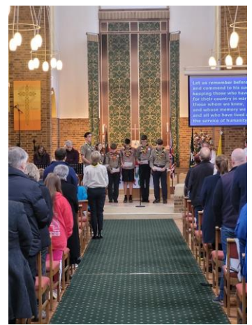
Remembrance day service and parade, November 2023