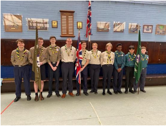
Leaders and members at HQ, February 2024

The 23rd Bromley (St. Augustine's) Scout Group was formed just before the outbreak of World War Two. The earliest record we have is a note in a log book saying the first Scout meeting was held on 7th November 1939. Once Scout Groups reach a certain size they are no longer covered by the Scout Association umbrella charity registration and are required to register individually with the Charity Commission. The Group was formally entered onto the Charity Commission register on 28th June 1974.