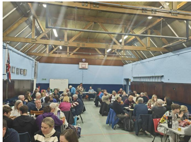
Pantomime, January 2024 and Quiz night, March 2024